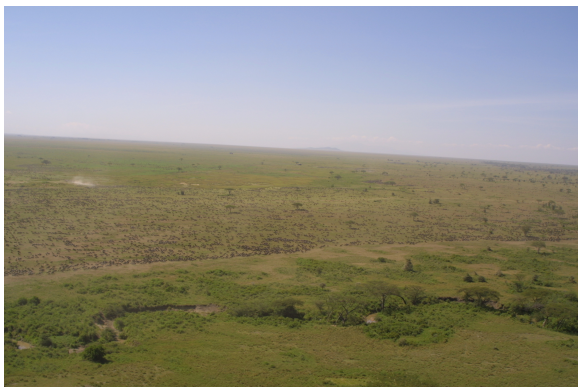
Fig. 3. Very far range photos.

In terms of goals, this data was used to distinguish between parts of an image which contain gnus and parts of the image which do not contain them. There is no intention of individual Gnu identification and counting in this sub-task. Figure 5