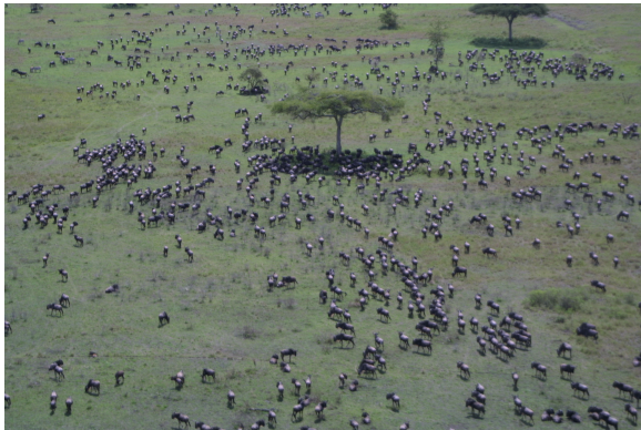
Fig. 2. Far range photos.

The first kind of data was used to classify parts of an image as belonging to one of the following classes: